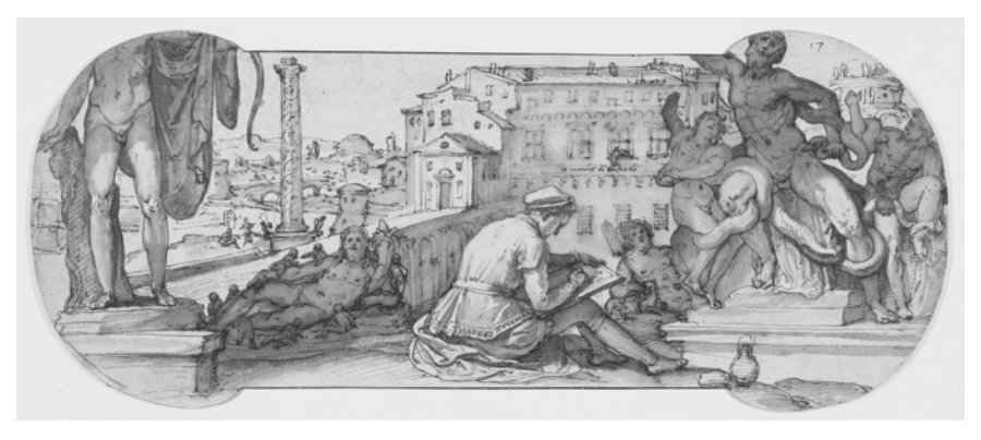
FIGURE 30.1 Federico Zuccaro, Taddeo Zuccaro in the Belvedere Courtyard in the Vatican Drawing the Laocoön , pen and brown ink, brush with brown wash, over black chalk and touches of red chalk, c. 1595