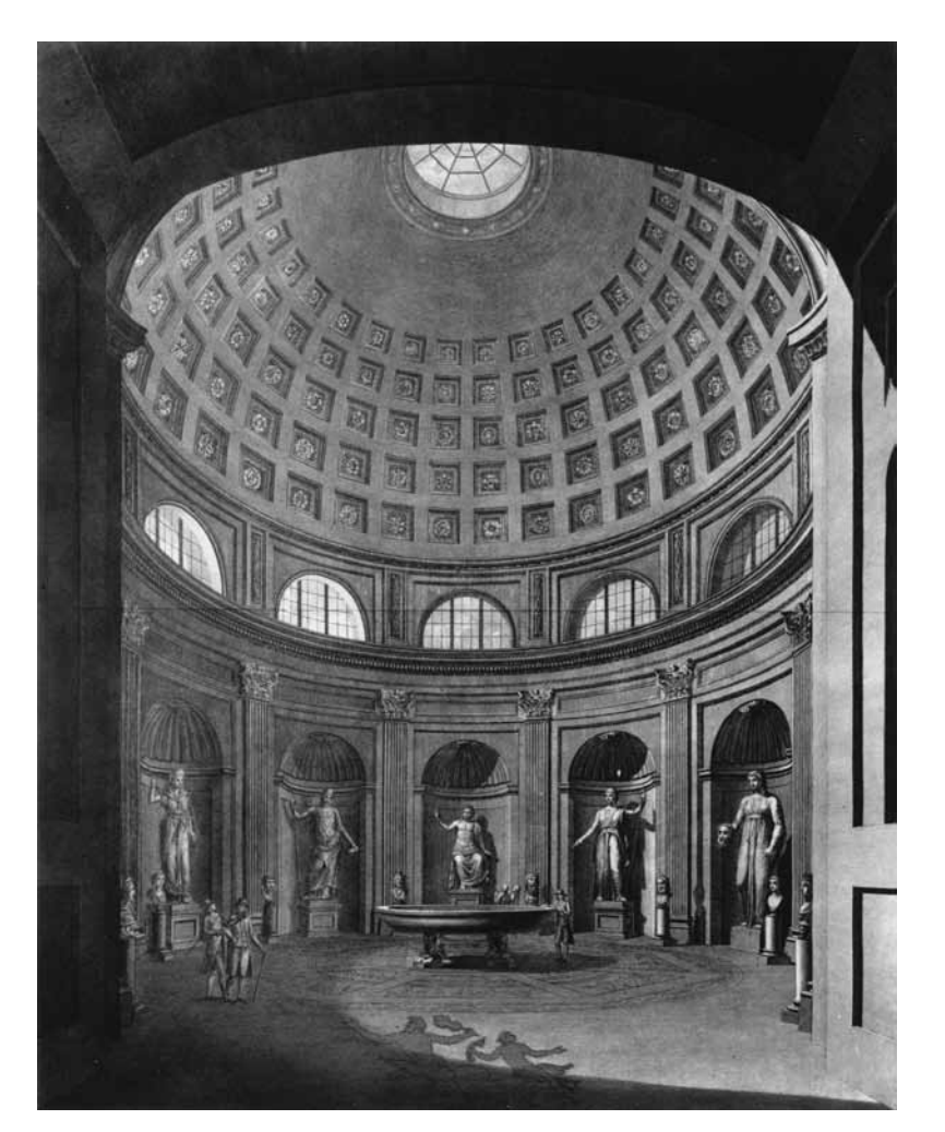
FIGURE 4-6. Vincenzo Feoli (Italian, ca. 1760–1827), after Francesco Miccinelli (Italian, act. 1790s), View of the Sala Rotonda in the Museo Pio-Clementino, Rome, ca. 1795. Etching and engraving

From the Egyptian atrium one passed into the romanizing Sala Rotonda, a symbolic fulcrum whose importance was enhanced in 1792 by the transfer of Julius II's massive porphyry basin from the octagonal court (fig. 4-6). The