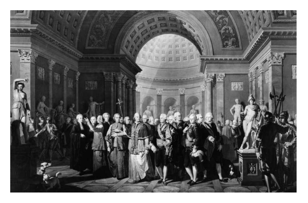
10.9 Bénigne Gagneraux, Pius VI Accompanying Gustav III of Sweden on a Visit to the Museo Pio-Clementino on January 1, 1784, 1786, oil on canvas; Prague, National Gallery

shifting sites and balances of power, and engaged the expanding expectations of tourists seeking the true Rome. As Benjamin put it in the wake of these innovations, 'Museums unquestionably belong to the dream houses of the collective.'79 But the specific forms they took also encoded their creators' evolving ambitions and identities. At the Capitoline, faced with foreign poaching on papal patrimony, Clement XII and Alessandro Gregorio Capponi created an innovative celebration of antiquity that privileged the artifacts' didactic value as witnesses to Roman history, and their propaganda value as links between an imperial past and a papal present. At the Vatican, in a world less and less persuaded that popes were anything like Caesars, Clement XIV, Pius VI, and Giambattista Visconti advanced the broader claim that it was the Church, not the State, that preserved Europe's essential heritage and values as embodied by Greco-Roman art. That contention would be tested by Napoleon, who appropriated masterpieces from both collections for the Louvre. Twenty years later they were back on their pedestals, although the larger debate is anything but settled.