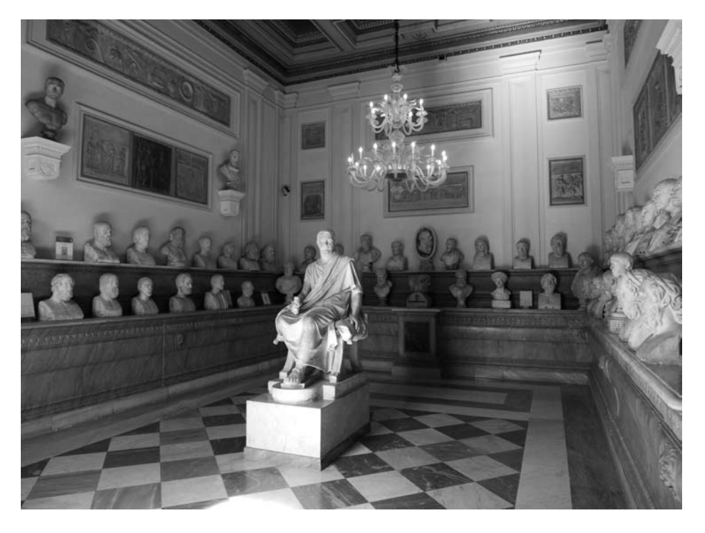
10.1 Room of the Philosophers in the Capitoline Museum, Rome, installed 1734

Nowhere was this truer than in eighteenth-century Rome, an age-old entrepôt enshrined as the culmination of the Grand Tour. If the Tour offered travelers the chance to form themselves through their reactions to new sights, it offered their hosts the chance to program those sites to deliver desired messages. In a city that was itself becoming a museum, Rome's publicly accessible art collections were increasingly central to both its selfunderstanding and its external image. Although historians are giving more attention to early museums' economic, legal, and administrative aspects, their spatial dynamics remain to be explored. There are challenges to be sure: few eighteenth-century theorists specifically discussed museum spaces, while most scholarship on architectural interiors has focused on the domestic realm. Museum historians often emphasize contents at the expense of their physical shell, and even where historic installations have survived, subsequent alterations obscure the original experience.2 Account books, inventories, diaries, catalogues, and guidebooks are thus essential documents, as are the plans, sketches, and souvenir prints that proliferated as signs of the museum's expanding visibility.