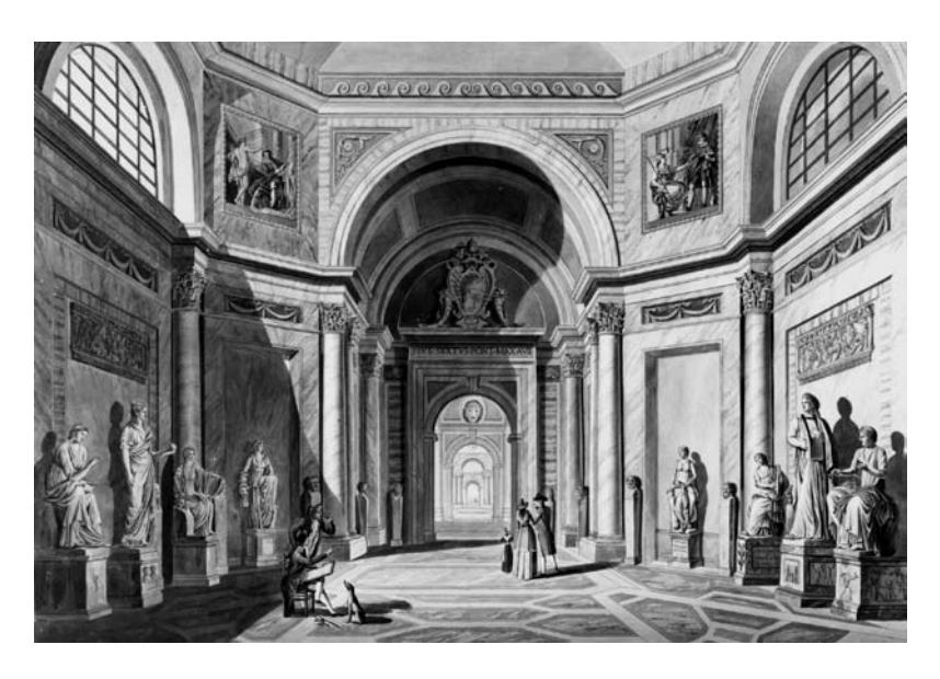
10.8 Giovanni Volpato and Abraham-Louis-Rodolphe Ducros, View of the Sala delle Muse in the Museo Pio-Clementino, Rome, looking towards the sculpture court, 1786–92, hand-colored line etching, 60 × 82.9 cm; Munich, Bayerische Staatsbibliothek, Res. 2. Arch. 170 M, #9