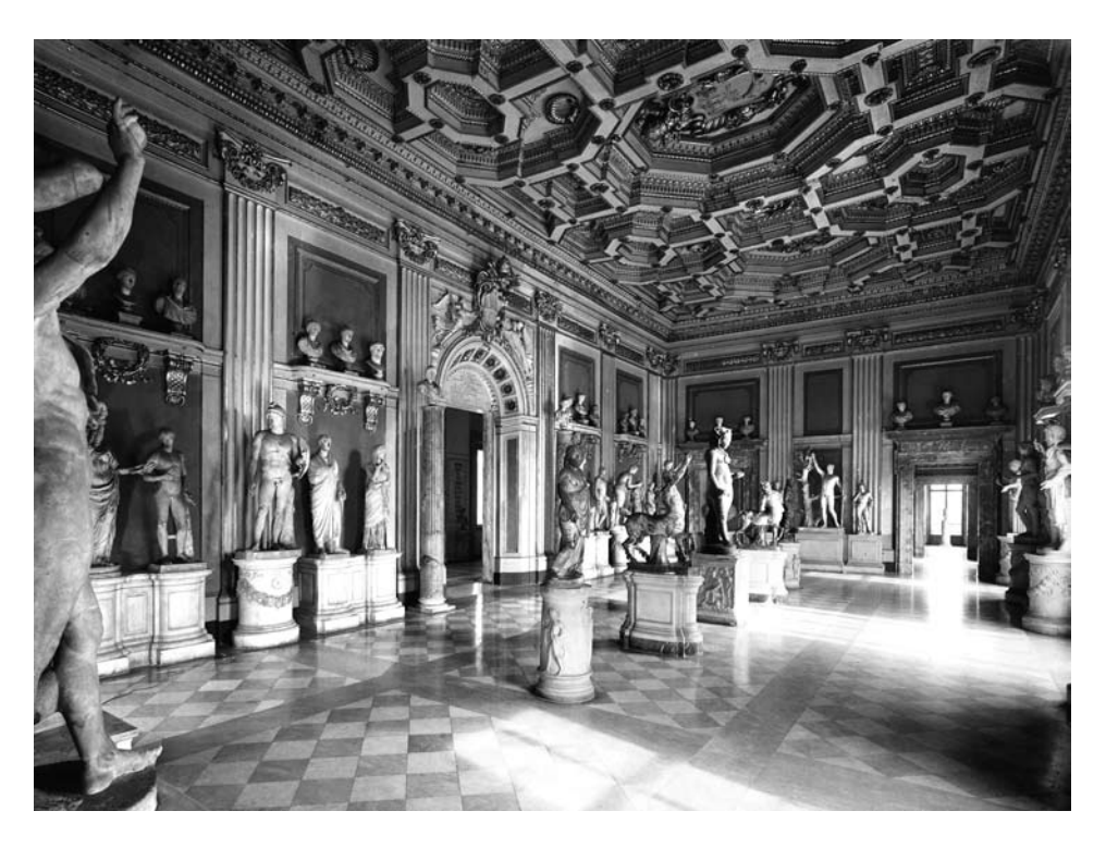
10.2 Main salon in the Capitoline Museum, Rome

a reconfigured Campidoglio. Some scholars have argued that the eastern structure was always intended for display, and, although an early plan to relocate dozens of statues was not realized, its rooms did receive antiquities as part of their decoration.<sup>12</sup> By the late seventeenth century the costs of upkeep induced the conservators to rent the building to Roman guilds as office space, and Capponi's first task was to transform the crowded 'Palazzo dell'Agricoltura' into a 'Palazzo delle Statue' worthy of receiving visitors.