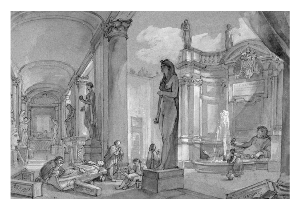
10.4 Charles Natoire, Artists Drawing in the Inner Courtyard of the Capitoline Museum in Rome, 1759, pen and brown ink, brown and grey wash, white highlights over black chalk lines on tinted grey-blue paper; Musée du Louvre, Prints and Drawings, INV3138, RMN173096/Art Resource

through the efforts of the recent popes exhausts admiration. Let us no longer hope to form collections like this; we live in a desert for antiquarians ... I blush a thousand times a day at those infinitely little relics preserved in our infinitely little cabinet of antiques, and am ashamed at having shown them to strangers ... Why did no one tell me about all of this?<sup>47</sup>