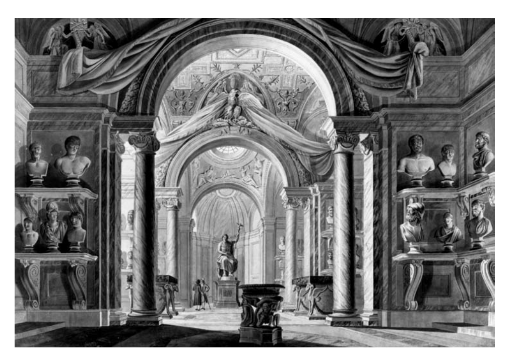
10.5 Giovanni Volpato and Abraham-Louis-Rodolphe Ducros, View of the Rooms of the Busts in the Museo Pio-Clementino, Rome, looking towards the Verospi Jupiter, 1786–92, hand-colored line etching, 60.3 × 82.5 cm; Munich, Bayerische Staatsbibliothek, Res. 2. Arch. 170 M, #11

competed both with the Campidoglio and with the great aristocratic galleries in which Rome's antiquities had long found a home.