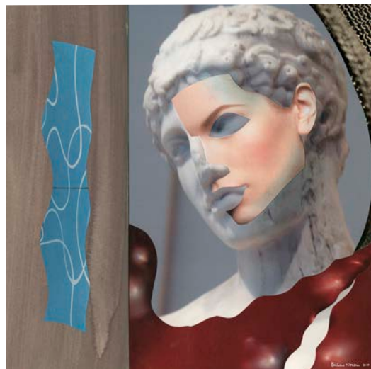
Barbara Nessim. Sea Pearl , from the series Chronicles of Beauty , 2010. Digital print on aluminum. Courtesy of the artist.

In recent years, Nessim has made increasing use of collage in many of her most powerful works, which often employ digital techniques as well. The last section of the exhibition features the original artwork for The Model Project (2009), plus larger digital prints on aluminum, such as Ancient Beauty (2009). Collages for Chronicles of Beauty (2010) are also on view, alongside some of the finished printed works.