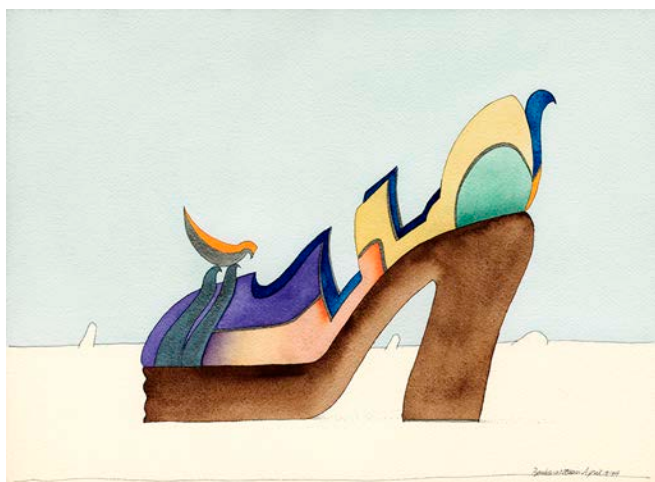
Barbara Nessim. Birdlike Shoe , 1974. Pen and ink, watercolor. Victoria and Albert Museum, E.39-2013.

Nessim also made a series of vibrant watercolors with equally enigmatic titles, including Beware of the Blue Sky Syndrome and Periscope Vision Isn't Everything . Works such as Blue Hair , Block Eyes , Cube Cheeks , and Striped Lips, Now! seek to explore women's engagement with contemporary fashion, or what Nessim calls "aspects of the female social mask." Man Looking at Woman Dancing or Three's a Crowd , for example, examine interpersonal relationships. Some watercolors were made for friends, including Gloria Steinem, Ali MacGraw, and Milton