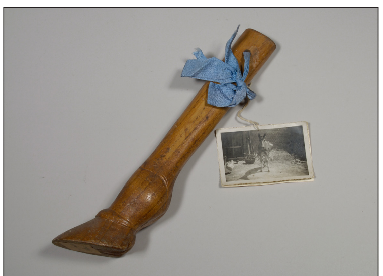
This expression of thanks was given to the Church of Our Lady of Rimedio in Orisanto, Sardinia. Leg of a donkey votive, Italy, 1951. Wood, carved and stained; photograph and silk ribbon. Rudolf Kriss collection, Asbach Monastery, Bayerisches Nationalmuseum, Munich.

well as more culturally specific The expressions.