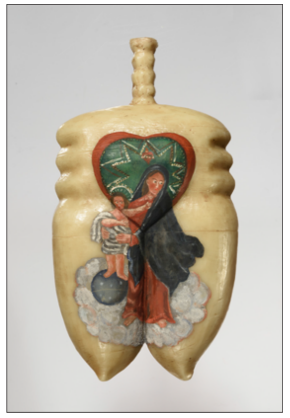
Wax items could be melted down and turned into church candles. Lungs votive, Germany, Eighteenth To Nineteenth Century. Wax, poured and drawn. Rudolf Kriss collection, Nationalmuseum. Bayerisches Munich.