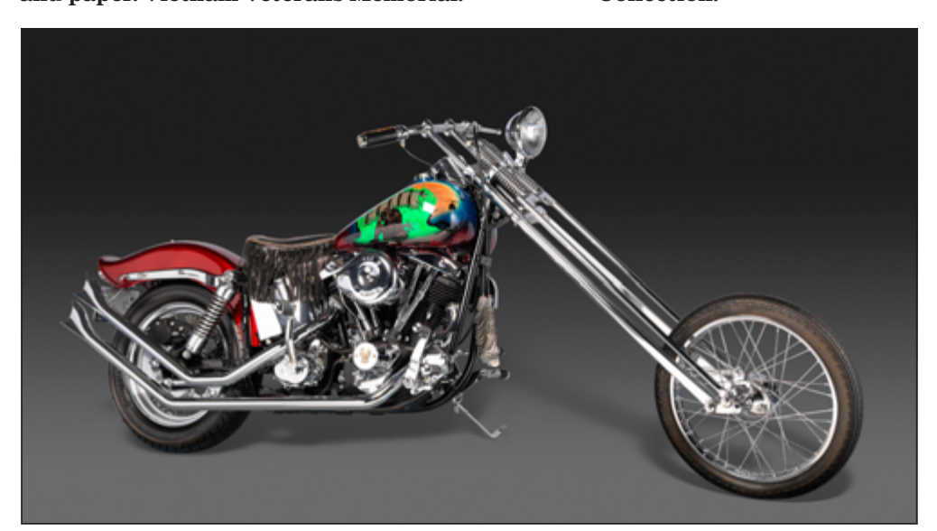
This tribute chopper honors soldiers missing in action from Wisconsin. Their names are painted on the gas tank. An escort made the three-day ride to bring it to The Wall on Memorial Day weekend in 1995. Customized 1994 Harley-Davidson Police Special motorcycle, deposited May 29, 1995. Vietnam Veterans Memorial.