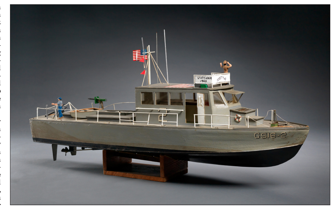
Navy patrol boat, river (PBR), deposited summer 2011. Vietnam Veterans Memorial.

Edited by Weinryb, the 372page accompanying catalog contains 17 essays and abundant illustrations. In it, scholars address such diverse themes as